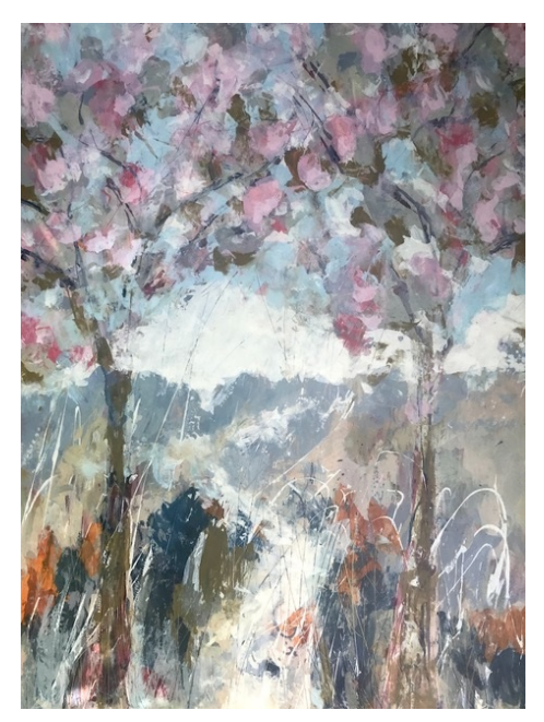
'Trail' Gail Mason 76x56 cm

Several North Somerset Artists will be showing at the very vibrant Bath Art Fair Half-price weekend tickets are available with the discount code HALFPRICEWEEKEND from <a href="https://www.bathartfair.co.uk">www.bathartfair.co.uk</a>